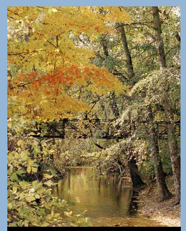
Chico Creek, CSU, Chico campus

Visit our Web site at www.cob.csuchico.edu for more information.